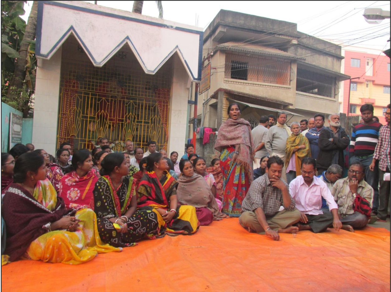
COMMUNITY CONSULTATION NEAR LALBABU NIKASHI, BAGJOLA CANAL – 1